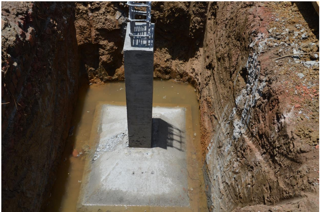
CASTING OF FOUNDATION