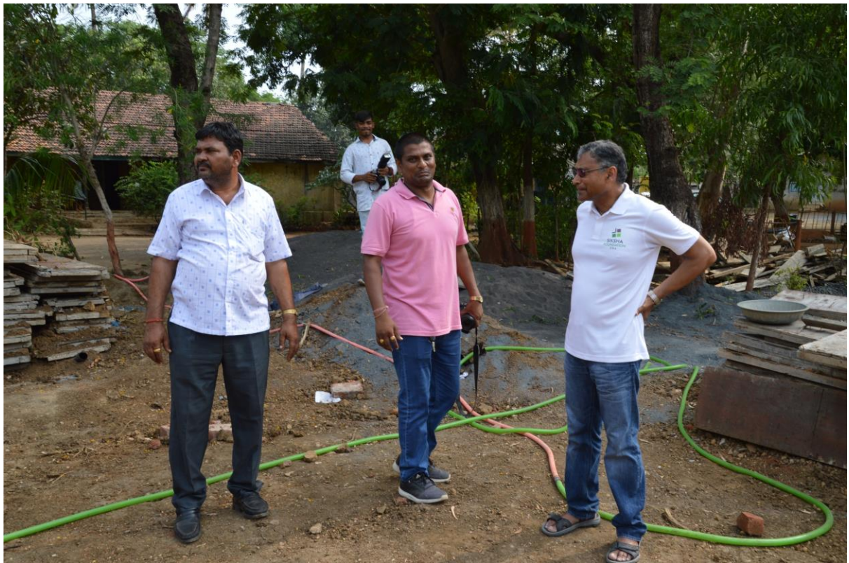
SITE VISIT BY SIKSHA EXECUTIVE