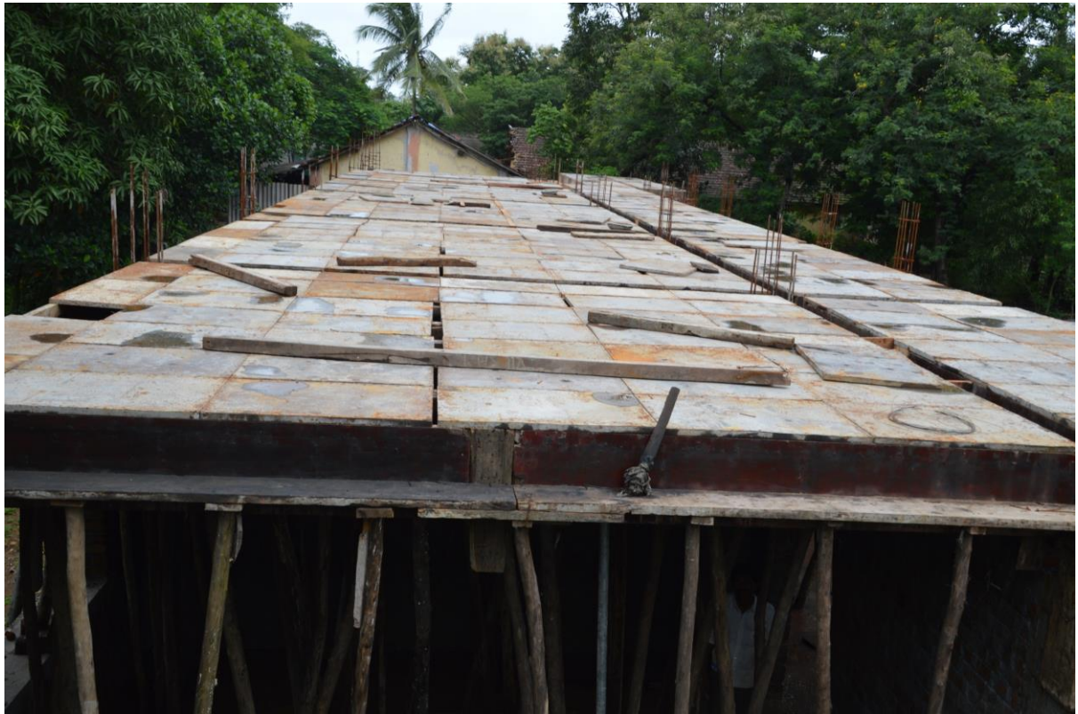
SHUTTERING TO CAST SLAB