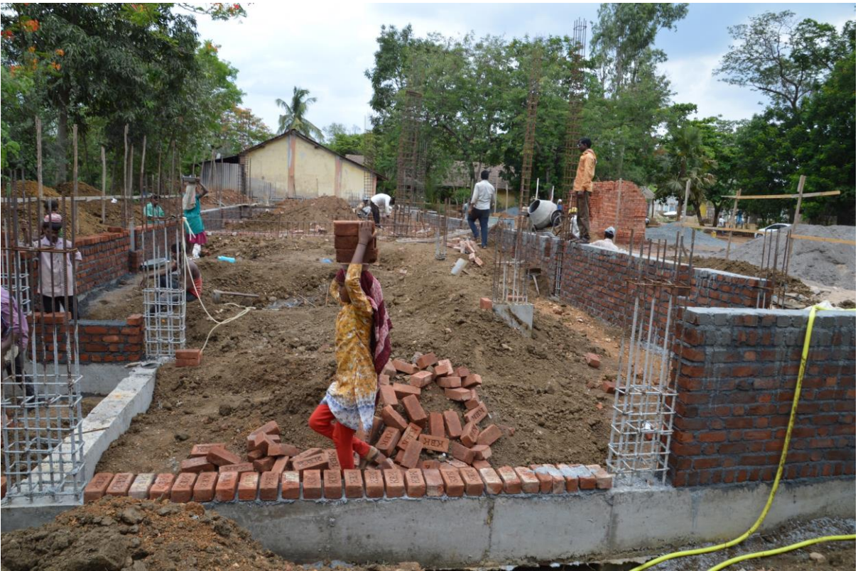
BRICK MASONRY FOR PLINTH