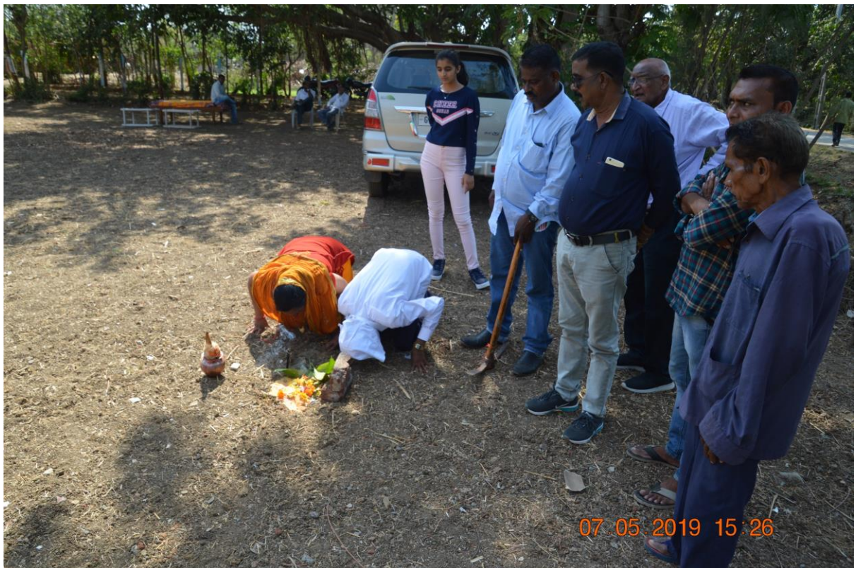
GROUND BREAKING CEREMONY