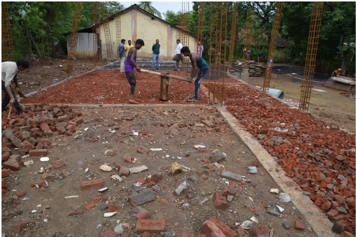
PREPARATIONS FOR PCC