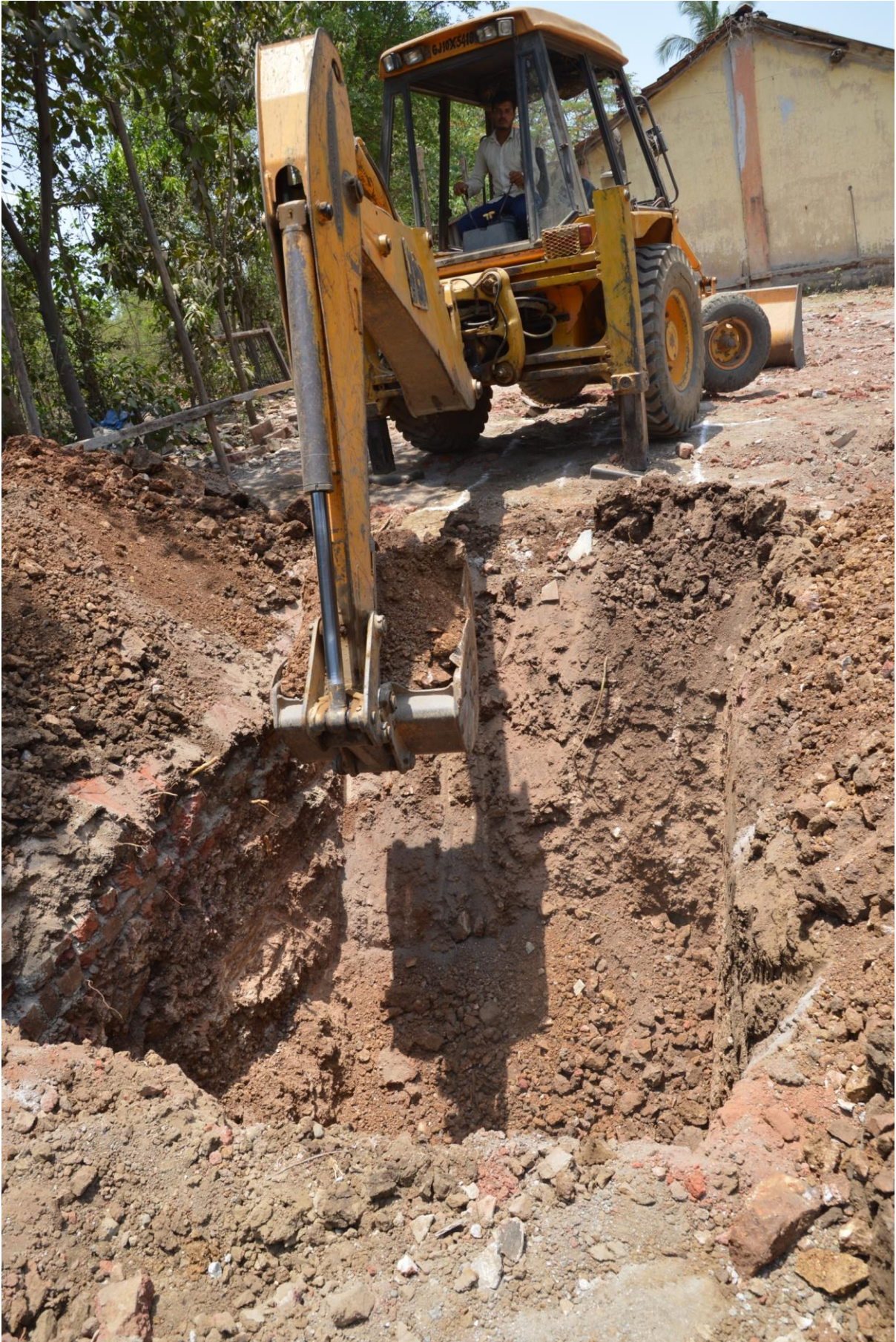
DIGGING FOR FOUNDATIONS