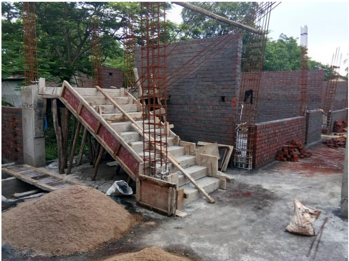
BRICK WORK FOR GROUND FLOOR