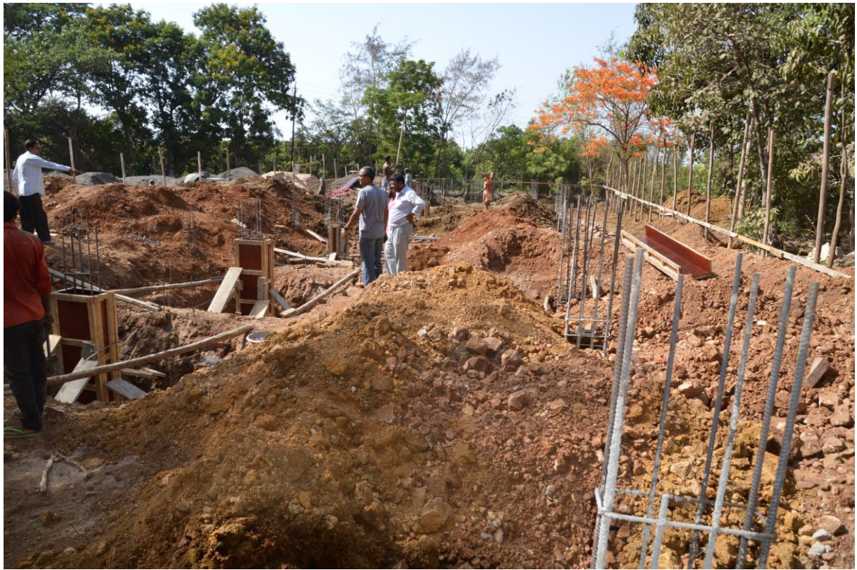
CASTING COLUMN ABOVE FOUNDATION