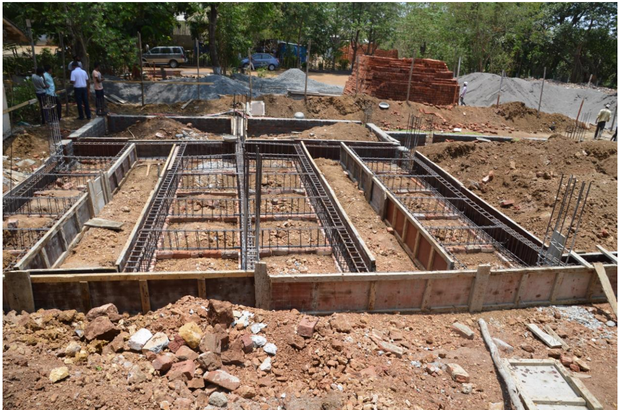
CASTING OF GROUND BEAMS