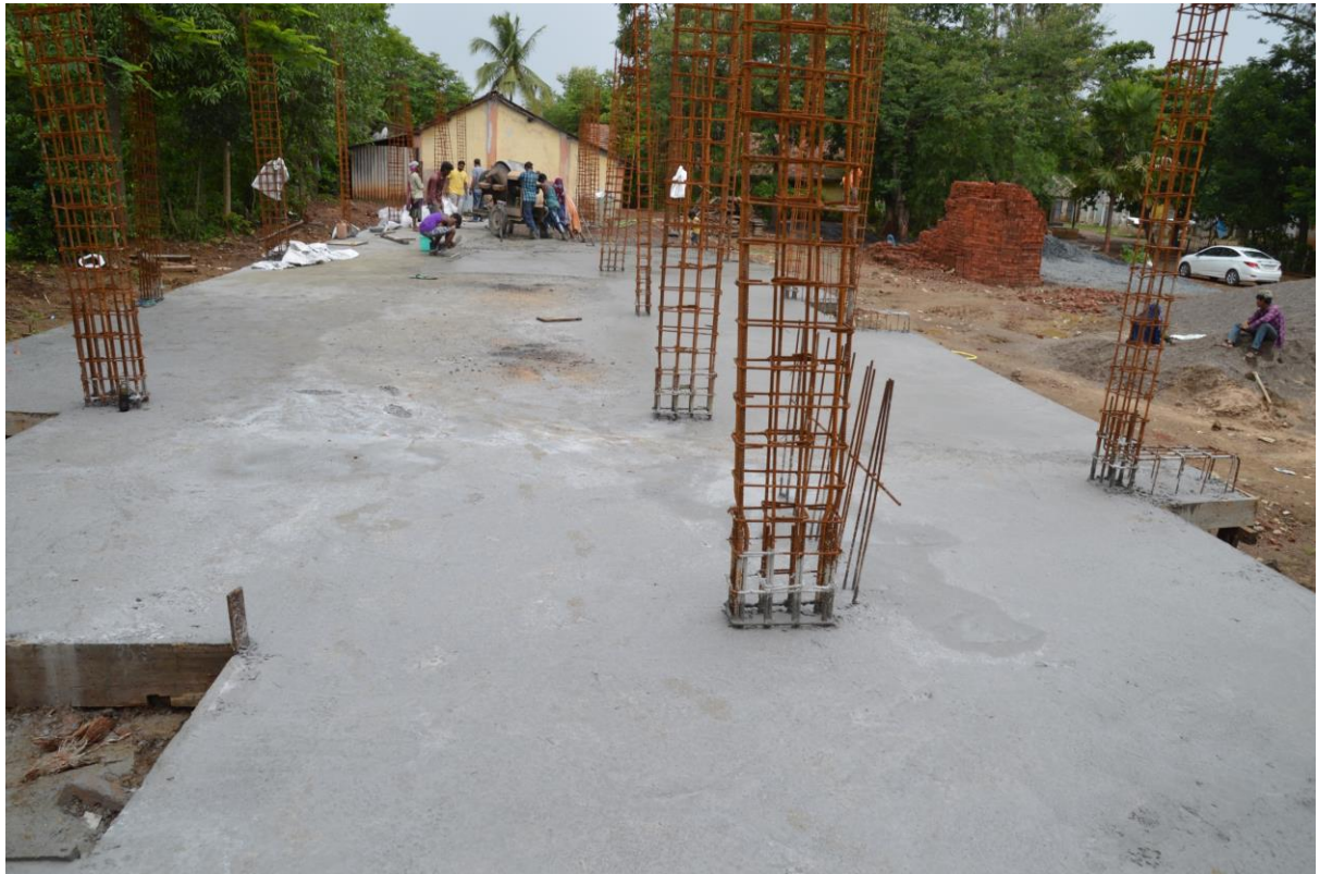
CASTING OF PCC