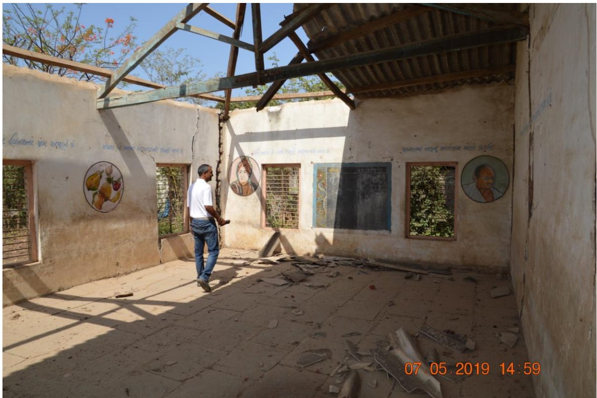
DEMOLITION OF OLD STRUCTURE