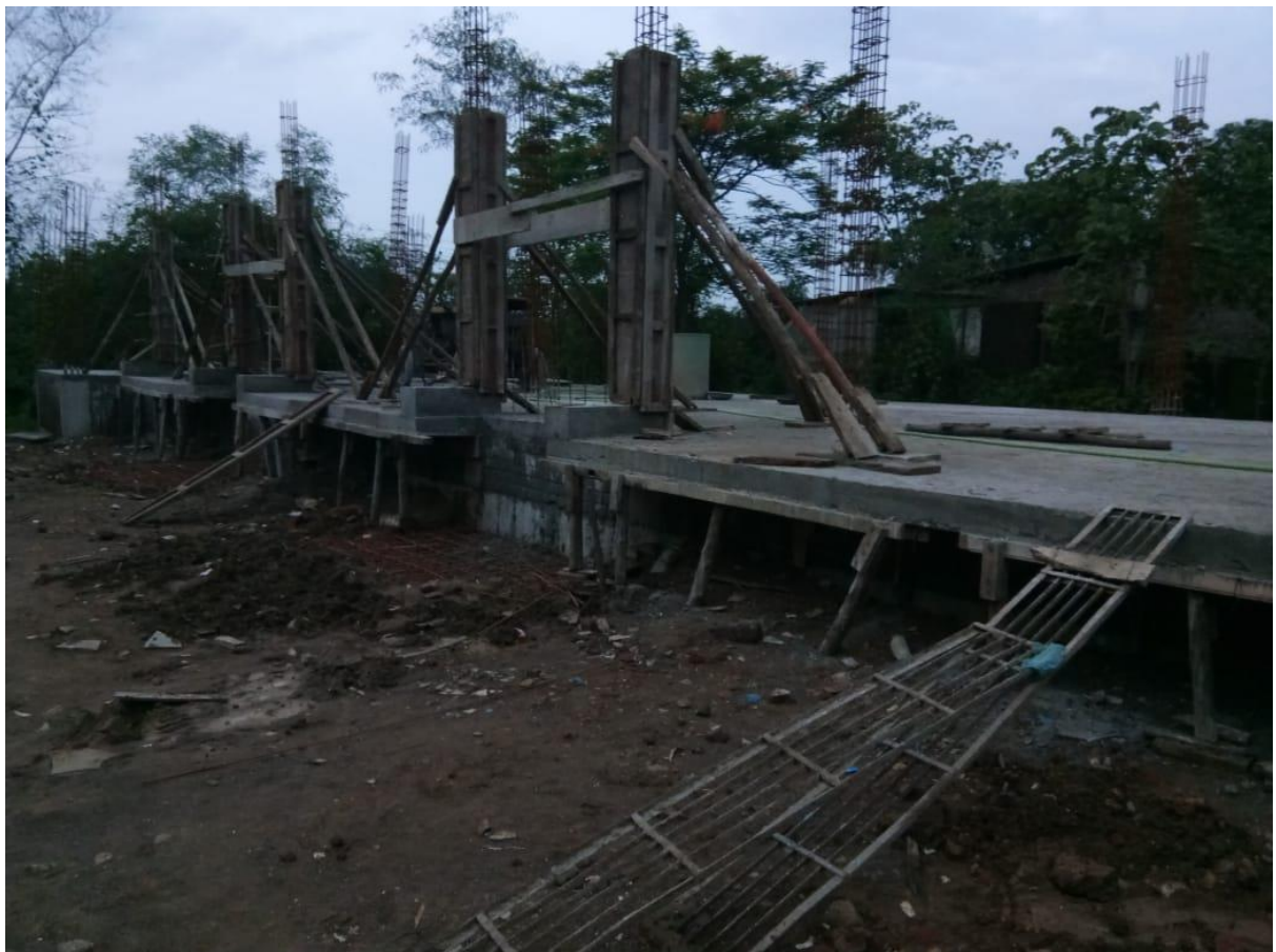
CASTING OF COLUMNS