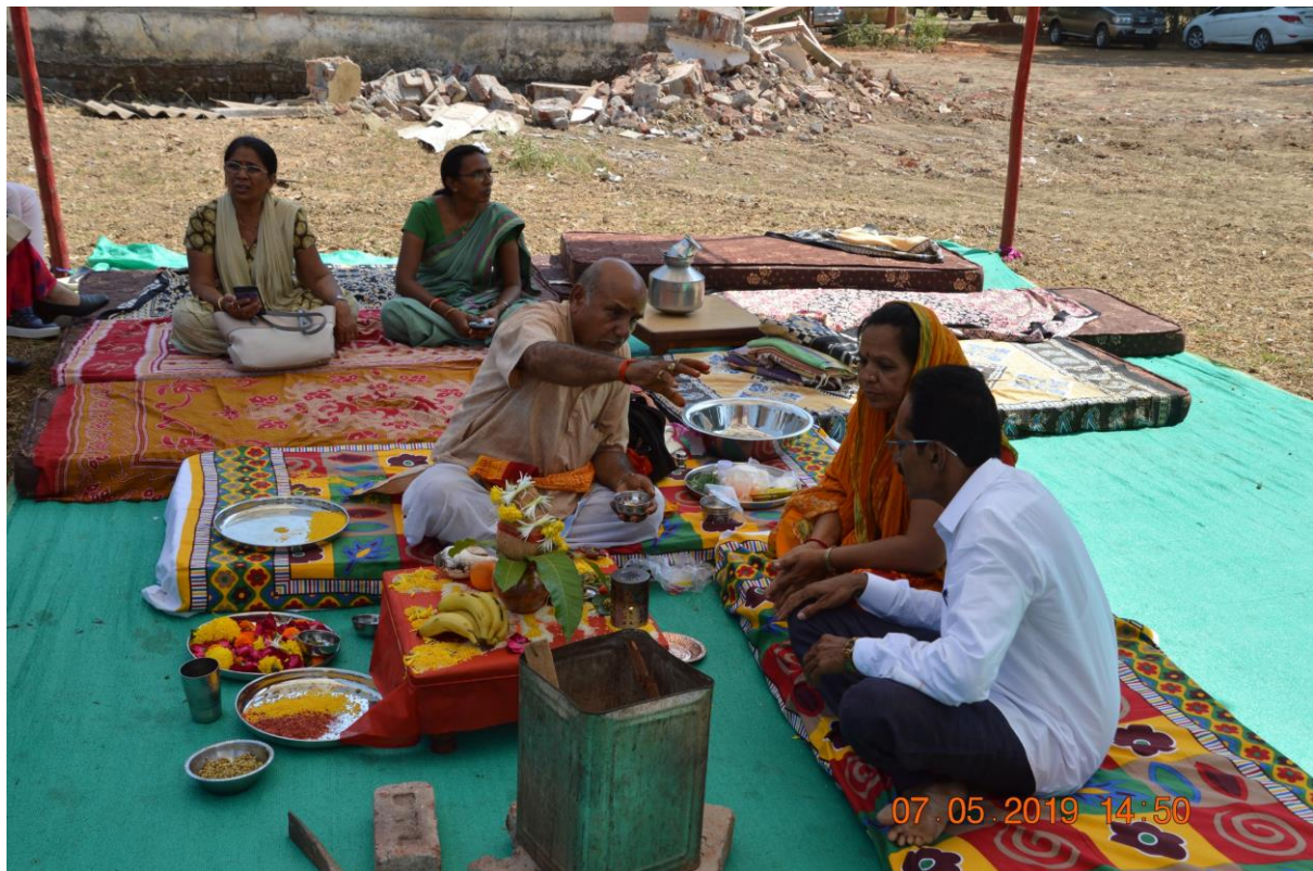
GROUND BREAKING CEREMONY