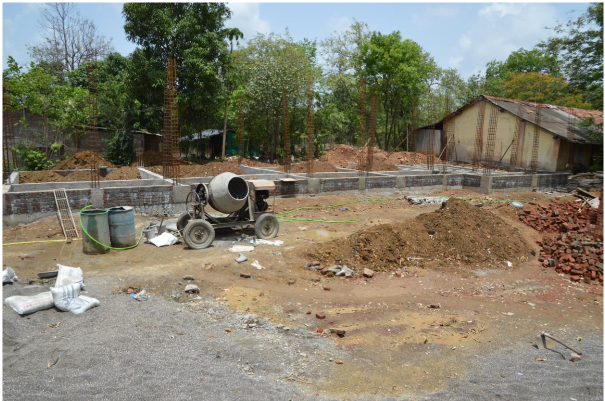
GROUND BEAM ON PLINTH