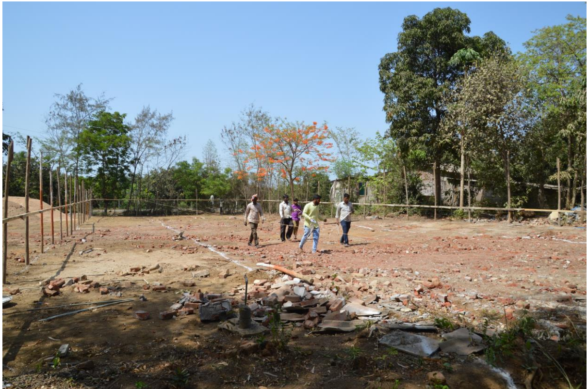
ALIGNING BUILDING ON GROUND